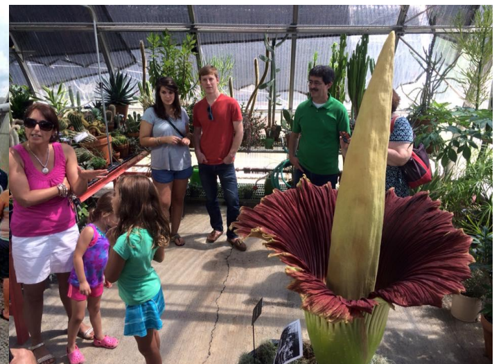
Left: the line to see Stinky Phil this past Sunday! Right: in full bloom!