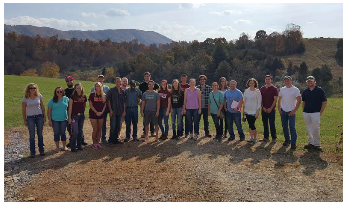
Group photo of the Small Fruit Production class at Beliveau Estates.