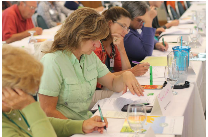
Participants at the Leadership Development Training.