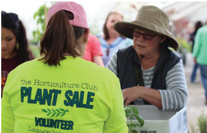
A Horticulture Club member rings up a happy customer.