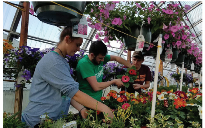
Organizing and pricing plants the evening before Plant Sale.