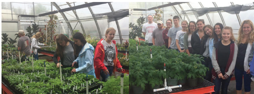
Students in Roger's Plant Propagation class.