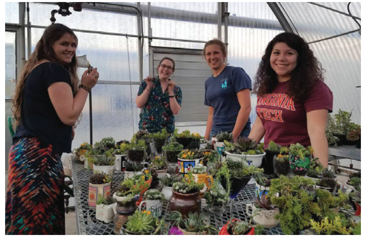
Preparing sedum teacup plantings before Plant Sale.