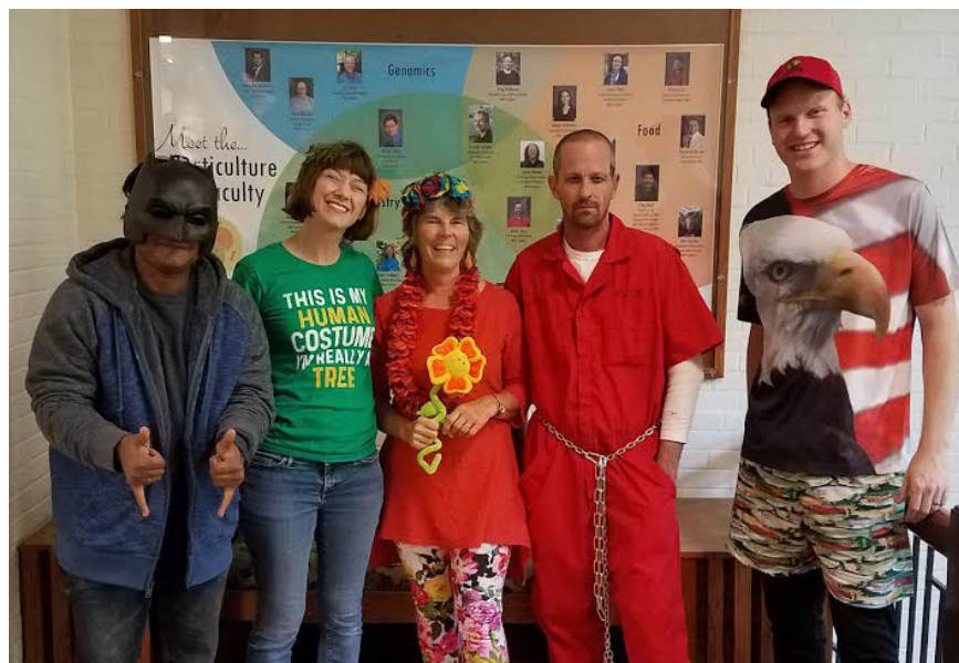
Halloween Greetings from the Horticulture Department!

Visit http://www.hort.vt.edu/hhg/events.html to learn more!