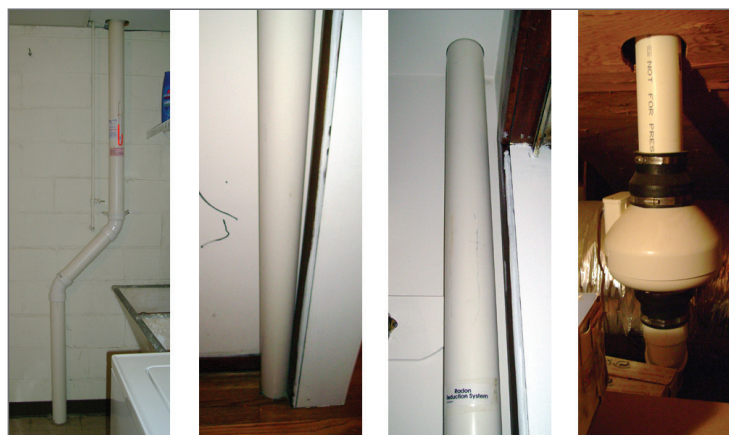
Radon remediation installation in my house in 2000. Left to right, a PVC pipe runs from the hole in the slab to the ceiling of the basement, up through the floor and ceiling of my daughter's closet, into the attic where it attaches to an exhaust fan, and up and out through the roof.

sump pump they buried in the floor of the storage room adjacent to the family room, filled the trench with gravel, and installed a flashing detail to ensure that any moisture seeping through the foundation wall would be guided into this trench rather than onto the surface of the slab—that is, the underside of my beautiful blonde laminate flooring. (See Figure 1.)