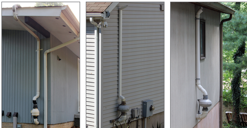
Signs of drunk roofers or radon mitigation systems?

To get the Scandinavian loft, I had to deal with the moisture problem, so my next step was to contact a company that deals with this variety of unpleasantness; that can promise you the dry basement of your dreams if you are willing to dig up portions of your floor. Some guys came out and demolished the 2 feet of slab adjacent to the foundation wall, put in a drain attached to a new