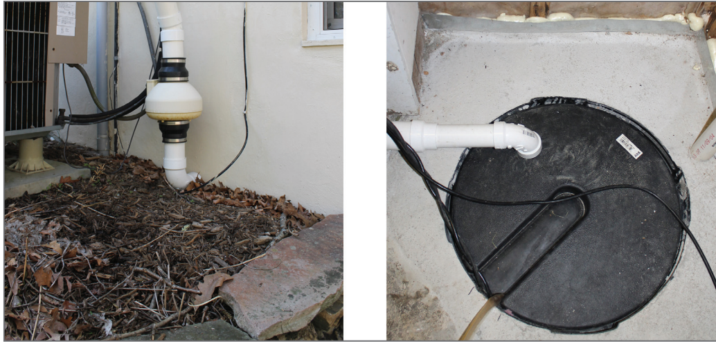
Second radon remediation installation in my house in 2012. On the right, a PVC pipe is installed through the sump pump lid, and on the left, it penetrates the foundation wall and is connected to an exhaust fan named R2D2. Spray foam was injected behind the perimeter drainage angle to close the air gap. The adhesive lines on the wood furring strips are likely left over from when one of the seven previous owners tore down wood paneling installed by an earlier previous owner.

another gorgeous PVC pipe through the lid of the sump pump. This led to, you guessed it, another hole through the house, this time through the back, exposed portion of the foundation wall to another exhaust fan sitting in the backyard. And, wonder of wonders, he happened to have just the right size exhaust fan in his truck! The irony of this was not lost on me, but I was eager to save a few bucks, and I figured if it still sucked, it still worked, at least for a while. We've nicknamed him R2D2, and he's actually not that bad looking when you consider the state of my ancient condensing unit right next to him.