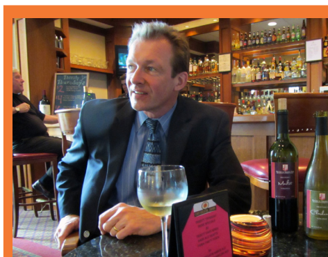
The Inn at Virginia Tech's fine-dining restaurant, Preston's, launched a Wine Society almost two years ago. Dinners and wine tastings as well as educational events are scheduled throughout the year. Please call 540-231-0120 for more information. Preston's private-label red and white wines are produced at Prince Michel Vineyards and Winery in Madison, Virginia.