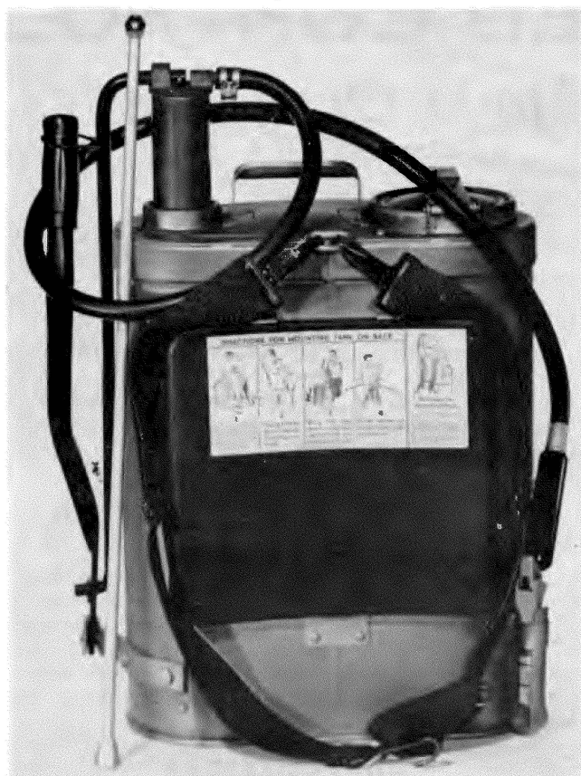
Fig. 1—Typical knapsack hand-sprayer.

Since this will probably be a "once-a-year" operation, a tractor mounted weed control sprayer would not be justified except in larger plantings or where the equipment could be used elsewhere on other weed problems. If a tractor mounted sprayer is used, the spray can be applied from a short boom for strip treatment, or by a hand-gun equipped with the above mentioned nozzle. Use about 40 lbs. pressure. Direct the spray downward and away from the trunk at all times.