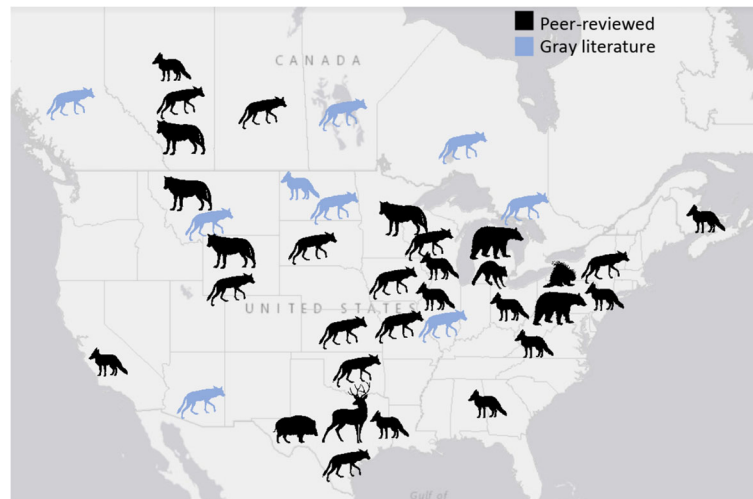
Fig. 3 Coarse overview of the areas and species reported infected with mange in the northern North America. The map shows patterns of mange distribution from scientific (black) and gray literature (blue). Silhouettes represent species where mange has been reported

predator control efforts [7]. More recently, sarcoptic mange has been closely studied in the Yellowstone National Park, Wyoming, where S. scabiei invaded the reintroduced wolf population in 2007 [8–10]. From these studies, we have found that wolves infected with S. scabiei may undergo behavioral changes to cope with the costs of infection, including decreased movement, selection of warmer habitats, increased food consumption, as well as increased social reliance on fellow pack members. Research has also explored the potential predictors of sarcoptic mange severity and associated mortality. Current studies show no associations between individual risk and severity of wolf mange infestations with pack size, age, sex, coat color. Previous infections do not appear to protect individuals from re-infection. Short-term population declines were noted during the initial outbreak of mange, but long-term impacts on population size and resiliency remain an understudied area.