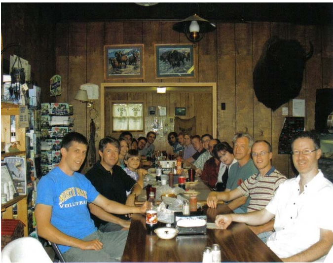
Philosophy Department Outing to Floyd