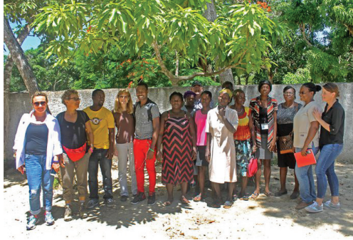
Team HAITI and with Haitian locals

Agricultural Technology Alumnus part of a group called TEAM Haiti that traveled to Haiti in Fall 2017