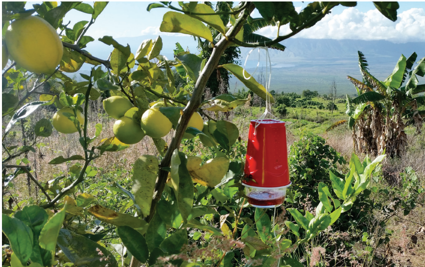
Figure 2. Trap installation: example of trap positioning on a lemon tree

jars, a drop of unscented dish soap was added to each jar to break the surface tension, and the lids and bands were affixed for transport.