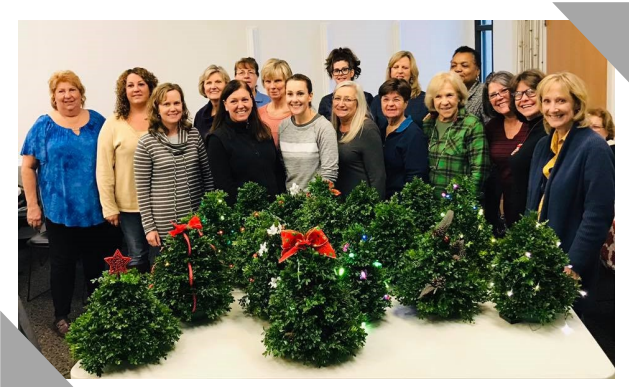
Participants in the Holiday Greenery Workshop held at the Powhatan Library, taught by Master Gardeners on Saturday, December 1

Wishing you a happy holiday season from all of us at the Powhatan Extension office! Thank you all for an amazing year, we are looking forward another great one in 2019!