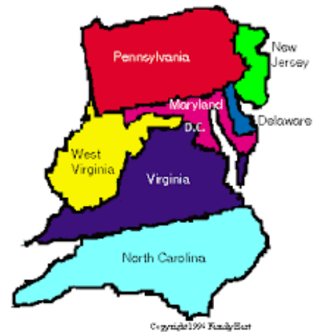
Figure 3.1. Mid-Atlantic Region, map based on USDA definition with the addition of North Carolina

Tree Specifications: We chose to focus on species native to North America in general and the Mid-Atlantic specifically. Native species exhibit fewer disease and pest problems and pose a lower risk of becoming invasive over time (Hightshoe, 1988). We define tree as any woody plant over 25 feet tall at maturity that is primarily single-stemmed. Both evergreen and deciduous trees were considered.