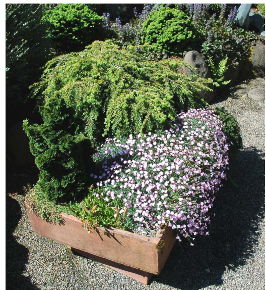
Photos 6 and 7 are examples of trough garden containers and plantings.