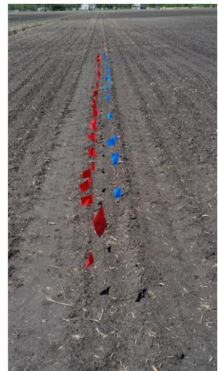
Figure 4: By contrast, in 2016 at Heath Cutrell → site, soil temperatures were warm and moist, prompting quick 100% germination by day 2. Note only red and blue flags. Day 1 shelled corn still weighed more than day 2 shelled corn.