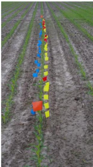
← Figure 3: In 2018 at Heath Cutrell site, soil temperatures were cool and wet. Germination was slow and spread out over a week. Result was 18 plants emerged on day 1 (red flags) and 30 plants emerged on day 2 (blue flags). After day 3, 31 plants emerged and were marked with yellow flags.