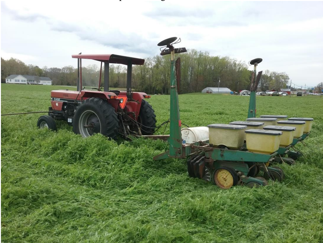
Figure 1. Planting corn into green hairy vetch cover crop on April 23, 2018

Rainfall was excessive for most of the season except for a 4 week dry period in late June to mid-July. Yields were good, but sandier parts of the field showed some drought stress and nitrogen deficiency. Research indicates that nitrogen from legume cover crops converts to the nitrate form fairly quickly, and leaching losses were probably fairly high given the heavy rains, especially on the sandier parts of the field. Sidedressing some nitrogen when utilizing legume cover crops is a good nutrient management practice. In addition, this plot was planted green into the standing cover crops (Figure 1). Stands were acceptable, but averaged about 22,000 plants per acre after being planted at 26,000 plants per acre. Corn following the hairy vetch cover crop yielded higher than the corn following the crimson clover cover crop. This is consistent with some of our past findings.