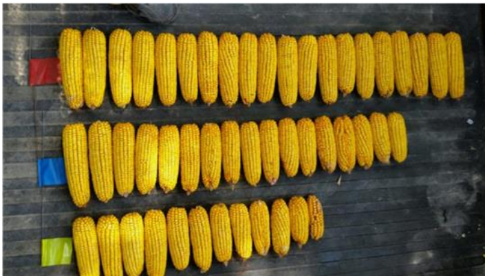
Figure 2: → Individual ears were counted, shelled, and weighed according to day of emergence.