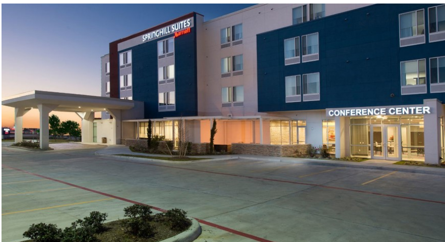
The SpringHill Suites Houston, a member of Hotel Equities' managed portfolio.