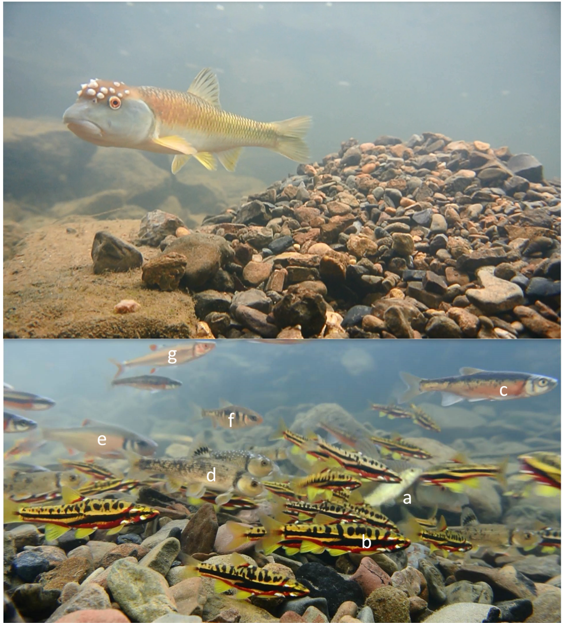
Fig 1. The nest and critical reproductive interactions around a common stream fish of North America. Top: A bluehead chub N. leptocephalus hovers over its completed and incubating mound nest. Bottom: An active nest with (a) host male bluehead chub initiating a spawning clasp and six nest associate species, including (b) mountain redbelly dace Chrosomus oreas , (c) rosieside dace Clinostomus funduloides , (d) central stoneroller Campostoma anomalum , (e) white shiner Luxilus albeolus , (f) crescent shiner L. cerasinus , and (g) rosefin shiner Lythrurus ardens . Photos are from Toms Creek, Virginia, US.

https://doi.org/10.1371/journal.pbio.2004261.g001