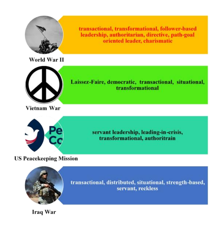
Figure 2. War-based leadership styles.

The selected movies reflect four major military operations (Figure 2). The first category of the movies are based on the Second World War, including The Bridge on the River Kwai (1957), Schindler's List (1993), Saving Private Ryan (1998), and Inglourious Basterds (2009). These movies portrayed mostly the authoritarian, transactional, transformational, and path-goal forms