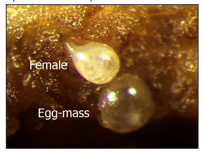
Fig. 1: Root-knot nematode female and an egg-mass dissected from a galled root.

Life Cycle: The short-lived adult males are vermiform and motile, and move into the surrounding soil to copulate with nearby females. However, males are not necessary since female root-knot nematodes are able to reproduce asexually. Adult females deposit eggs into a protective gelatinous matrix, near or just outside the root surface. A single female lays about 500 to 1,500 eggs during her life, which lasts about two to three months (Fig. 1). Eggs hatch only under favorable conditions, such as adequate moisture and warm temperatures. The life cycle takes anywhere from 17 to 57 days, depending on the host plant and environmental conditions. Typically, root-knot nematode development begins inside the egg. After the completion of embryogenesis, the first-stage juvenile remains inside the egg until it molts into the second-stage juvenile. Secondstage juveniles hatch from the egg and move freely in the soil in search of a suitable host plant (Figs. 2a, 2b). Root-knot nematode second-stage juveniles undergo an additional three molts before transforming into the adults. Root-knot nematodes have a low host plant penetration rate at temperatures below 50°F, and a reduced reproduction rate at temperatures below 58°F.