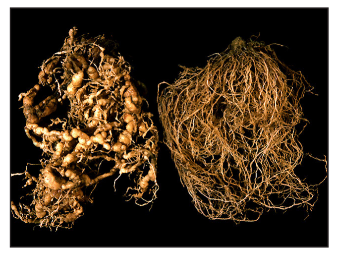
Fig. 3: Comparison between root-knot nematode infected root (left) and a non-infected root (right).

If nematode populations are high and growing conditions are good, damage may not be visible, but yield may be reduced. Severe damage is often visible and yield losses heavy if corn was stressed during the early part of the season. A fourth common species of root-