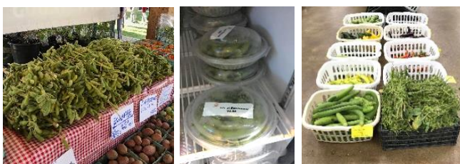
FRESH EDAMAME AT THE FARMER'S MARKET (LEFT), VIRGINIA TECH DINING HALL (MIDDLE), AND INTERNATIONAL SUPERMARKET IN BLACKSBURG, VA (RIGHT).

There is vigorous growth in demand for edamame over the past two decades, estimated at 12-15% annually. Edamame has quickly become the second largest soyfood consumed in the U.S. (25,000-30,000 tons annually) and is being sold in many grocery chains, farmer's markets, and restaurants such as McDonald's.