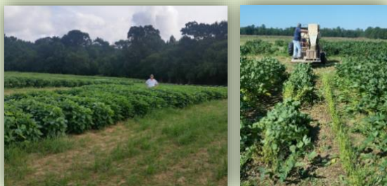
EDAMAME PLOTS AT THE EASTERN SHORE AREC (LEFT). EDAMAME PLOTS BEING HARVESTED MECHANICALLY USING A SNAP-BEAN HARVESTER (RIGHT).

Edamame is typically planted early spring and harvested late summer to early fall. Edamame is harvested as a vegetable when the seeds are immature but have expanded to fill 80 to 90% of the pod width while moisture levels remain at 65-70%. It can be harvested by hand or mechanically.