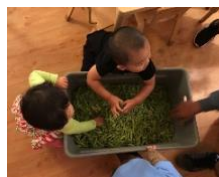
SOME YOUNG EDAMAME FANS AT THE VIRGINIA TECH DAYCARE.