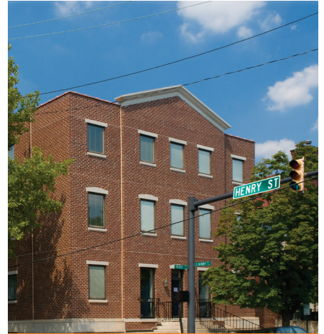
1021 PRINCE STREET / ALEXANDRIA