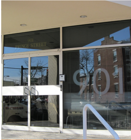
901 PRINCE STREET / ALEXANDRIA