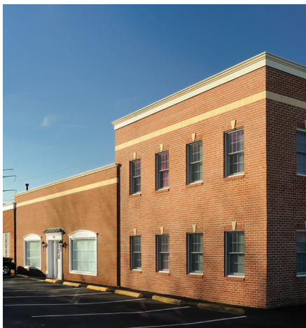
9408 PRINCE WILLIAM STREET / MANASSAS