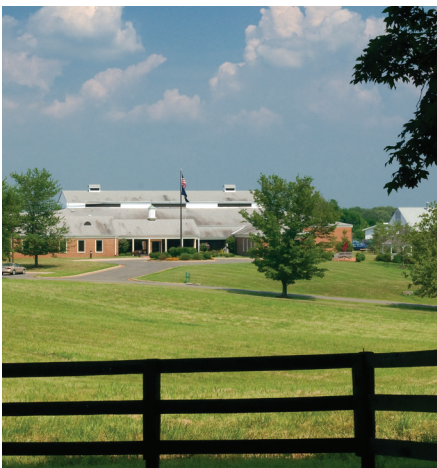
17690 OLD WATERFORD ROAD / LEESBURG