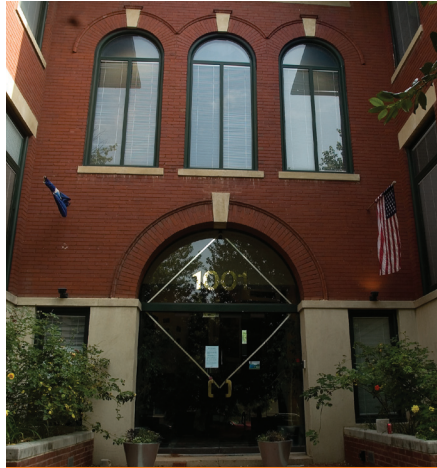
1001 PRINCE STREET / ALEXANDRIA