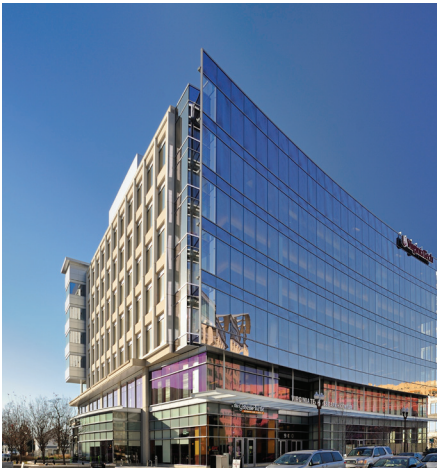
900 NORTH GLEBE ROAD / ARLINGTON