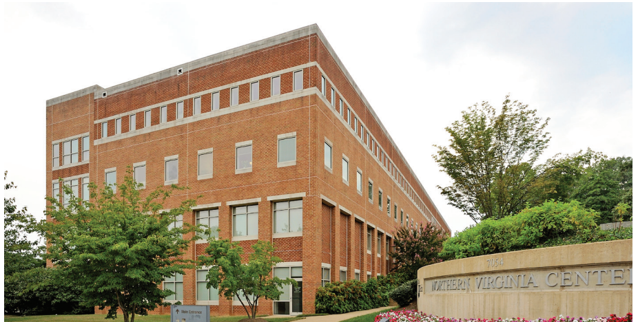
7054 HAYCOCK ROAD / FALLS CHURCH