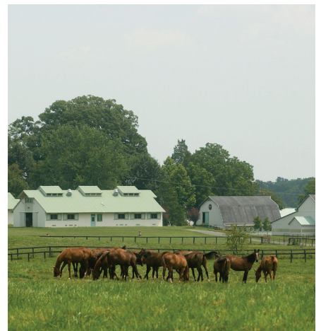
5527 SULLIVANS MILL ROAD / MIDDLEBURG