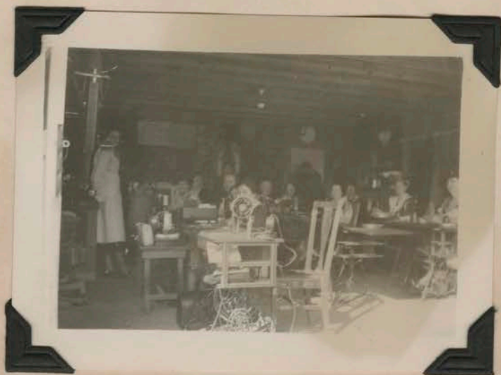
Sewing Machine Clinic held at Deepwater in Norfolk County, March 3, 1937.