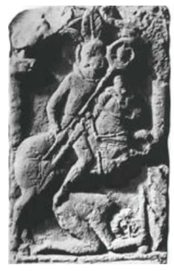
Figure 2: Tombstone of ala Petriana's signifer at Red House Fort

on the eastern flank of the Stanegate road and early Roman frontier, Rome used this fort to guard a crossing at the River Tyne. The second and final fort was constructed of stone following the destruction of the first fort and was used as a supply depot and support base during the construction of Hadrian's Wall from 112 to 128. Remains of several granaries dating from this period have been discovered, showing that Corbridge evolved into an important supply center and depot on the northern frontier, even when the frontier moved north to Hadrian's Wall.<sup>7</sup>