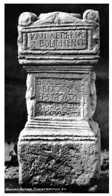
Figure 4: A Corbridge Dolichenus.

Inscriptions throughout Britain are also some of the best sources that show where legionary and auxiliary units were stationed, when they served and fought, and the building projects in which they participated. Corbridge is no different from other Roman forts and towns and has a wide variety of inscriptions revealing which military units were garrisoned in Corbridge. One inscription, dated between 197 and 202, reveals that a detachment of the Sixth Legion's Pia Fidelis Unit worked on Corbridge's headquarters under the governor Virius Lupus.<sup>20</sup> Various other inscriptions reveal further building projects conducted in Corbridge by various military units between the first and fourth centuries. While many legionary altar similar to the one dedicated to Apollo and auxiliary records have been lost since Maponus. This one is dedicated to Jupiter the end of the Roman Empire, inscriptions allow modern scholars to determine which legionary and auxiliary units served