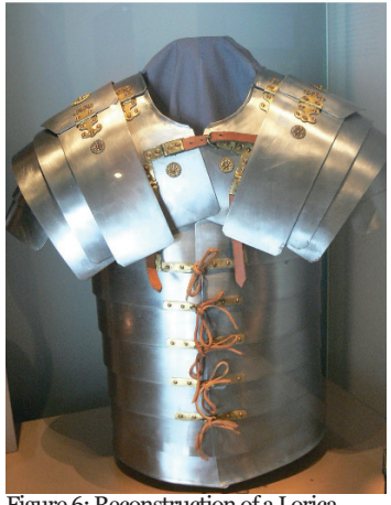
Figure 6: Reconstruction of a Lorica Segmentata similar to those used by the Corbridge Hoard

the segmented plates had been discovered to show how this armor functioned and was put together. Before this discovery, the modern understanding of lorica segmentata came primarily from Trajan's Column in Rome, which featured thirty different carvings of soldiers wearing lorica segmentata armor. <sup>25</sup> While the lorica segmentata reliefs engraved on Trajan's Column provide a basic outline and view of the armor, how the Romans used it, and what it looked like, they did not provide any insight as to how the armor functioned or was worn. The lorica segmentata segmented plates in the Corbridge Hoard, as seen below, provided scholars and historians with a much-needed example of how this armor functioned and was put together and worn.