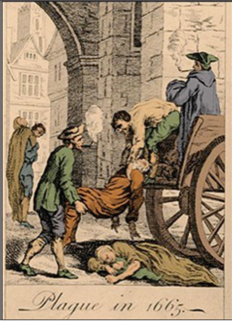
Unknown Artist, "Great Plague of London-1665," Wikipedia Commons

acute diseases from chronic." 44 Other authors contend that it was changed due to Christian practices, such as the observation of Lent, the length of the great flood of Noah, or the length of Jesus' stay in the wilderness. Regardless of the reason, the increased quarantine time offered an improvement; it better insured that the ships in question did not pose a health risk to the city.