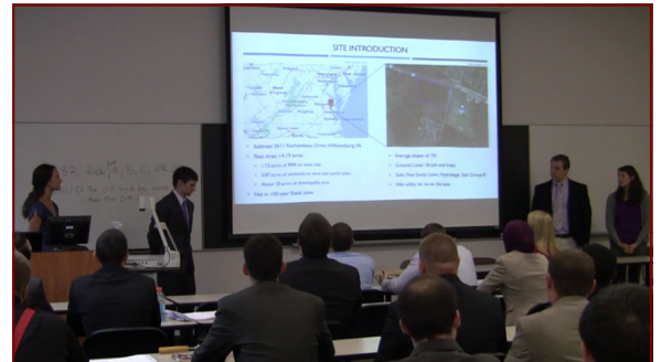
A student design team mentored by AES Consulting Engineers present their final design project.

CEE 4274 - Land Development Design remains a tremendously popular course offering in the Via Department of Civil & Environmental Engineering, and the spring 2014 semester saw the course at its maximum enrollment of 40 students for the first time since 2007! Beginning in the fall 2006 semester, and facilitated through LDDI, students taking CEE 4274 have been paired with at least one engineer from an LDDI sponsoring firm, who serves as their mentor throughout the entirety of a semester-long design project. LDDI would like to thank the individuals from the following firms for their time and energy to serve as mentors to CEE 4274 students during the 2013-2014 academic year: