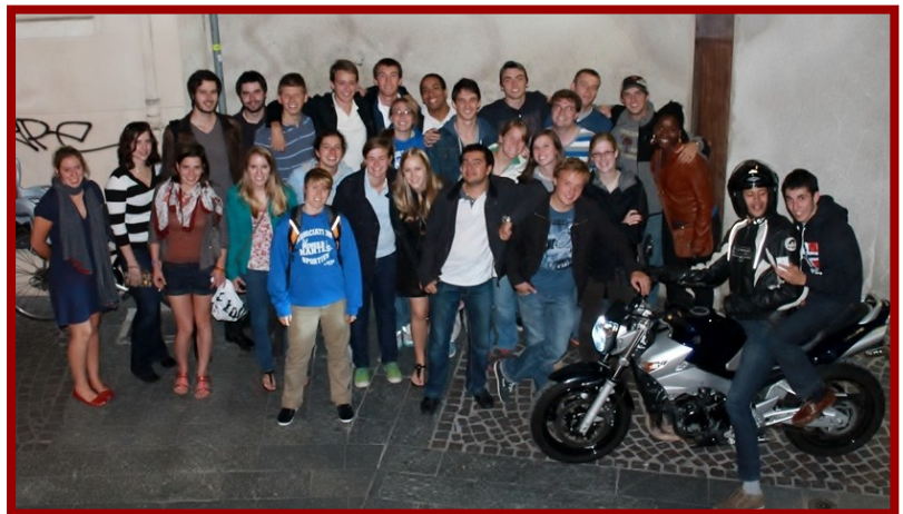
Virginia Tech and École des Mines students in Nantes, France