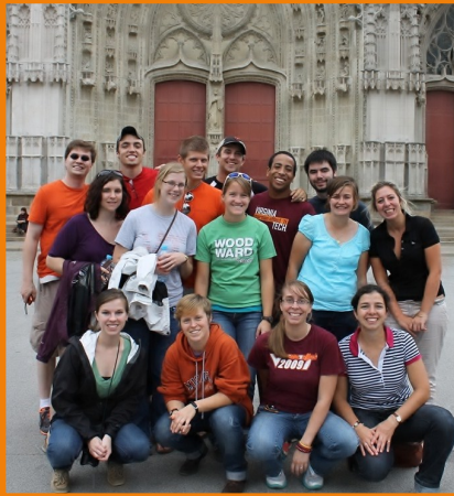
Virginia Tech and École des Mines students in front of the Nantes Cathedral

Seniors in Industrial & Systems Engineering are required to take ISE 4005: Project Management and System Design. According to the class description, ISE 4005 is a capstone design sequence allowing students to work in teams to develop a proposal and implement an industrial engineering design project for real-world clients. This real-world application sets ISE apart from other departments at Virginia Tech.