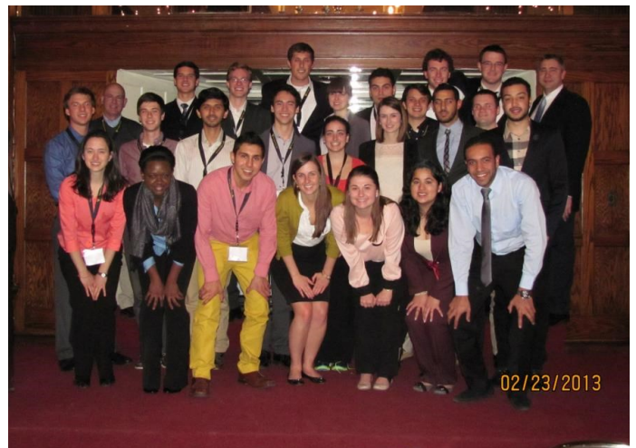
VT IIE members at the Mid-Atlantic Regional Conference

Virginia Tech's Undergraduate ISE Program was recently named 8th in the nation!