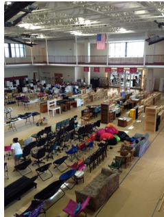
The McComas gymnasium was the fall selling site.

One of the key things employers like to see on potential employees' resumes is job experience. Some students do not have that critical internship or co-op, so the ISE Ambassador Community Involvement Committee has supplied students with ways to give back to the Blacksburg community while applying ISE skills.