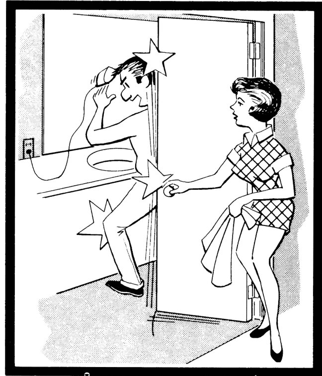
Bathroom doors should swing into the bathroom, but with sufficient clearance to avoid striking an individual using one of the fixtures.