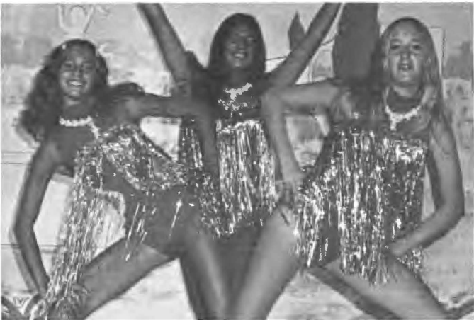
Growth and development through 4-H is shown by 4-H'ers performing at State Fair.