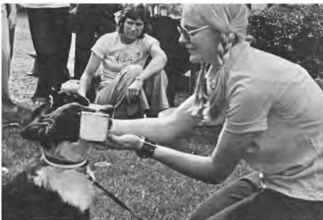
Working with pets – 4-H’er demonstrates advanced dog-training. Dog Care and Training is another 4-H project.