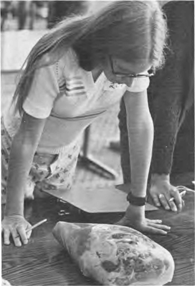
Decision making – 4-H'ers participate in Meats Identification and Judging. They learn decision making and expression through justifying their placings.