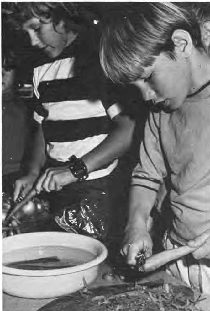
Learning by doing – 4-H’ers learning Mulligan Stew through the television program are preparing their meals in a school club situation.