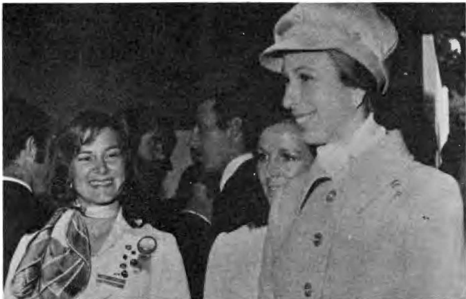
Cultural exchange — Princess Margaret with Virginia IFYE on exchange program. State, national and international exchange programs are available in 4-H.

Four-H activities and events provide additional opportunities for personal development. Some examples are: 4-H Educational Center Programs (camp, backpacking, trail riding, canoeing), Cultural Exchange, 4-H Share-the-Fun, National 4-H Week, Community Service and Citizenship, Recreation, Demonstrations and Illustrated Talks, Recognition and Public Speaking.