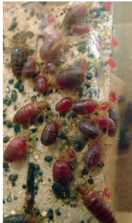
Fed bed bugs

The lifecycle data presented in this publication is based on research conducted using bed bugs collected from apartments within the state of Virginia. These populations have documented resistance to pyrethroid insecticides. Laboratory studies have indicated that resistant bed bugs have a shorter developmental time (several days), shorter life spans and lower levels of egg production than bed bugs that are not resistant to insecticides. At the time of this writing, practically all "natural" bed bug populations collected in Virginia have been found to be a least somewhat resistant to pyrethroid insecticides.