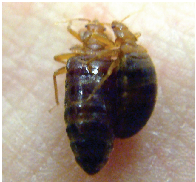
Bed bugs mating

In practical terms, this means that a single mated female brought into a home can cause an infestation without having a male present, as long as she has access to regular blood meals. The female will eventually run out of sperm, and will have to mate again to fertilize her eggs. However, she can easily mate with her own offspring after they become adults to continue the infestation.