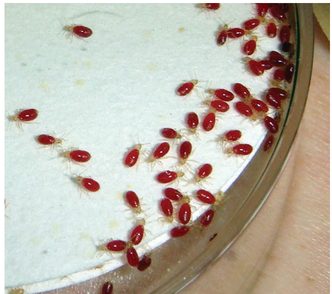
First instars after feeding

The time it takes any particular bed bug nymph to develop depends on the ambient temperature and the presence of a host. Under favorable conditions, such as a typical indoor room temperature (>70° F), most nymphs will develop to the next instar within 5 days of taking a blood meal. If the newly molted instar is able to take a blood meal within the first 24 hours of molting it will remain in that instar for 5-8 days before molting again. At lower temperatures (50° F - 60° F), a particular instar may take two or three days longer to molt to the next life stage than a nymph living at room temperature. However, if a bed bug nymph does not have access to a host, it will stay in that current instar until it is able to find a blood meal, or it dies. The time for a bed bug to develop from an egg, through all five nymphal instars, and into a reproductive adult is approximately 37 days.