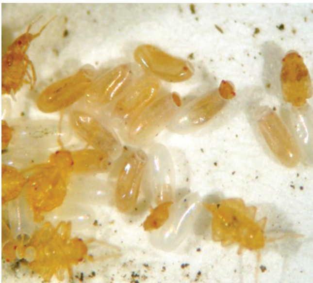
Bed bug eggs hatching