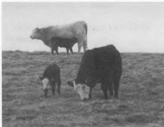
Grazing should provide a majority of nutrients.

Water is primarily absorbed in the large intestine . Undigested feed, some excess water, and some metabolic wastes leave the large intestine as fecal material. The consistency of manure is an indicator of animal health and is dependent on water, fiber, and protein content of the feed. For example, cattle on lush spring forage will have profuse watery, greenish colored manure, whereas animals on a hay diet will have firm manure that is dark in color. Animals should produce manure that is indicative of the diet they are receiving. If not, it may indicate a digestive upset or disease. Light colored manure, manure tinged with blood, and watery manure (when on a dry diet) are not normal situations. Manure should not smell putrid or rancid. Producers should recognize changes in manure that indicate problems.