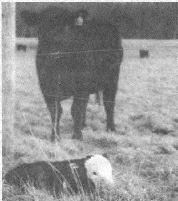
Proper nutrition is essential for good reproduction.

The mouths of cattle are very different from most non-ruminant animals (Figure 1). Cattle have 32 teeth. They have 6 incisors and 2 canines in the front on the bottom. The canines are not pointed but look like