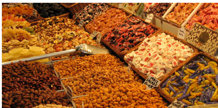
Figure 1. Photo of dried fruits and vegetables.