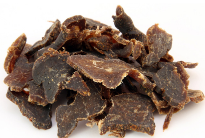
Figure 2. Photo of dehydrated beef (beef jerky).