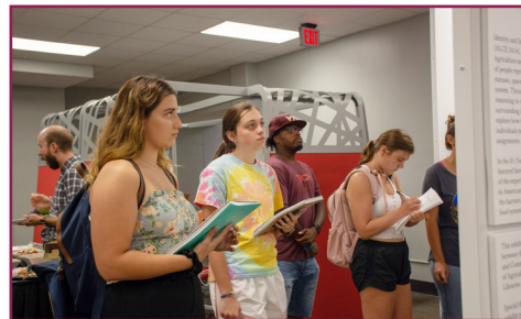
Students and visitors evaluate student projects during the library exhibit for ALCE 2414.