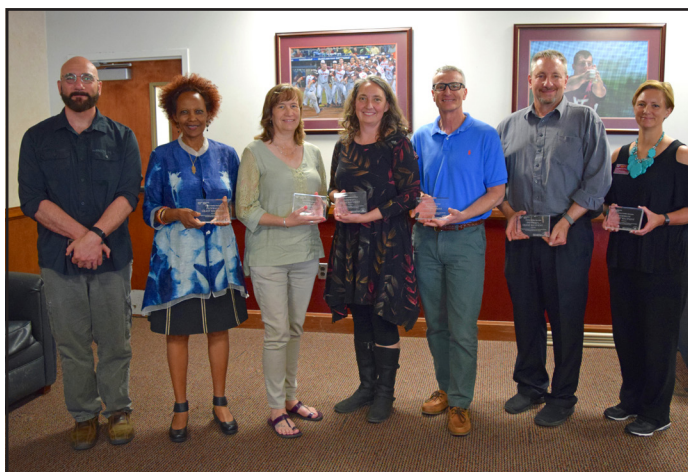
Some of the past Pathways Grant recipients at the CETL Third Annual Recognition of Teaching Excellence Celebration on April 24, 2019