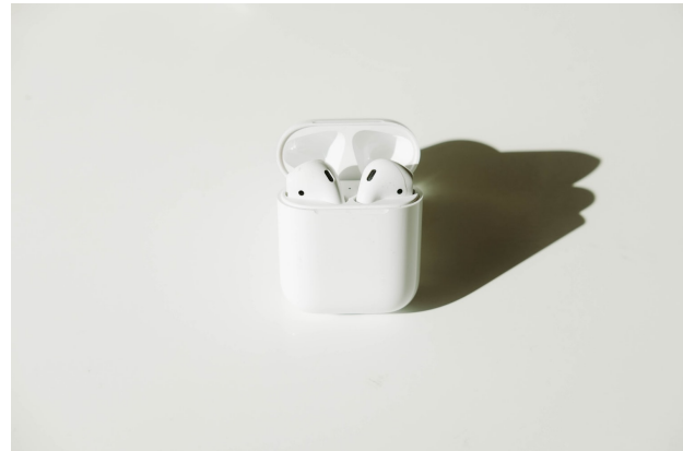
Figure 14.11: AirPods

Consumer perception of a company is often important to a company’s success. Many companies, therefore, manage their public relations in an effort to garner favorable publicity for themselves and their products. When the company does something noteworthy, such as sponsoring a fundraising event, the public relations department may issue a press release to promote the event. When the company does something negative, such as selling a prescription drug that has unexpected side effects, the public relations department will work to control the damage to the company. Each year the Hay Group and Korn Ferry survey more than 1,000 company top