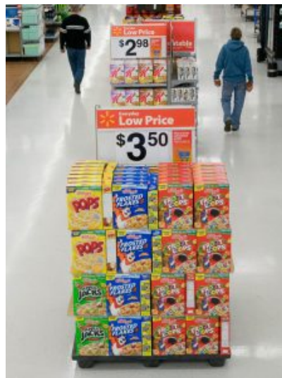
Figure 14.10: Sales Promotion at Wal-Mart

It's likely that at some point, you have purchased an item with a coupon or because it was advertised as a buy-one-get-one special. If so, you have responded to a sales promotion —one of the many ways that sellers provide incentives for customers to buy. Sales promotion activities include not only those mentioned above but also other forms of discounting, sampling, trade shows, in-store displays, and even sweepstakes. Some promotional activities are targeted directly to consumers and are designed to motivate them to purchase now. You've probably heard advertisers make statements like "limited time only" or "while supplies last." If so, you've encountered a sales promotion directed at consumers. Other forms of sales promotion are directed at dealers and intermediaries. Trade shows are one example of a dealer-focused promotion. Mammoth centers such as McCormick Place in Chicago host enormous events in which manufacturers can display their new products to retailers and other interested parties. At food shows, for example, potential buyers can sample products that manufacturers hope to launch to the market. Feedback from prospective buyers can even result in changes to new product formulations or decisions not to launch.