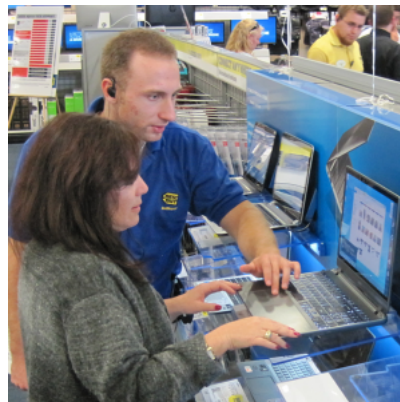
Figure 14.9: Personal Selling at Best Buy