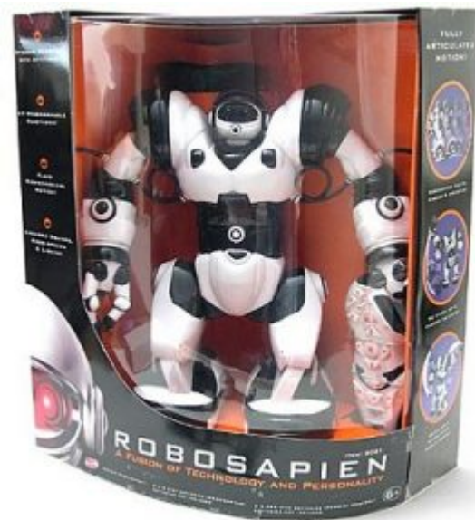
Figure 14.6: Robosapien in Its Package

Packaging can serve many purposes. The Robosapien package attracts attention to the product's features. For other products, packaging serves a more functional purpose. Nabisco packages some of its snacks—Oreos, Chips Ahoy, and Lorna Doone's—in "100 Calorie Packs." The packaging makes life simpler for people who are keeping track of calories.