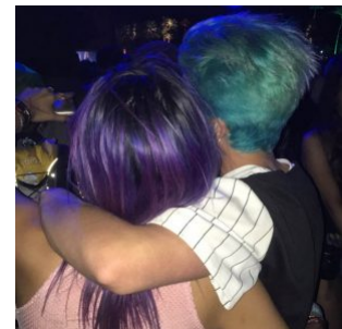
Figure 14.14: Two Friends Who Disagree on Which Mountain Dew Flavor to Vote For

When PepsiCo announced it wouldn’t show a television commercial during the 2010 Super Bowl game, it came as a surprise (probably a pleasant one to its competitor, Coca-Cola, who had already signed on to show several Super Bowl commercials). What PepsiCo planned to do instead was invest $20 million into social media marketing campaigns. One of PepsiCo’s most successful social media initiatives has been the DEWmocracy campaign, which two years earlier, resulted in the launch of product–Voltage–created by Mountain Dew fans. 34 Now called DEWcision, the 2016 campaign asks fans to vote between two rival flavors of Mountain Dew. The campaign engages a number of social media outlets with challenges for fans to earn votes for their favorite flavor, including Twitter, Instagram, and Facebook. 35 The example in Figure 14.14 is for a challenge to dye your hair the color of your favorite flavor, then Tweet the picture with the hashtag #DewDye. According to Mountain Dew’s director of marketing, “PepsiCo looks at social media as the best way to get direct dialog with their fans and for the company to hear from those fans without filters. ‘It’s been great for us to have this really unique dialogue that we normally wouldn’t have,’ he said. ‘It really has opened our eyes up.’” 36