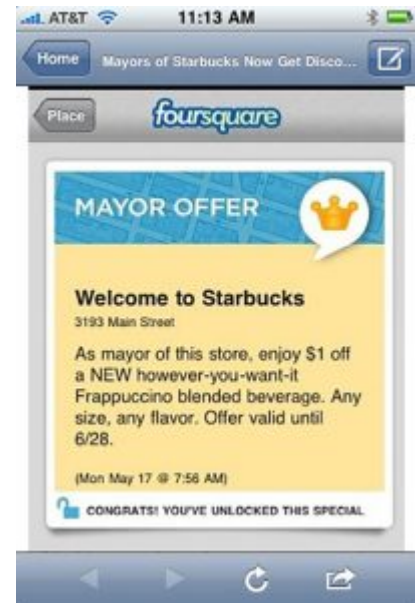
Figure 14.15: Starbucks and Foursquare Promotion

This promotion was a joint effort of Foursquare and Starbucks. Foursquare is a mobile social network, and in addition to the handy "friend finder" feature, you can use it to find new and interesting places around your neighborhood to do whatever you and your friends like to do. It even rewards you for doing business with sponsor companies, such as Starbucks. The individual with the most "check ins" at a particular Starbucks holds the title of mayor. For a period of time, the mayor of each store got $1 off a Frappuccino. Those who used Foursquare were particularly excited about Starbucks's nationwide mayor rewards program because it brought attention to the marketing possibilities of the location-sharing app. 38