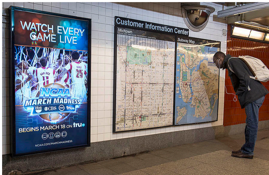
Figure 14.8: A Digital Advertising Screen in the New York Subway

Advertising is paid, non-personal communication designed to create an awareness of a product or company. Ads are everywhere—in print media (such as newspapers, magazines, the Yellow Pages), on billboards, in broadcast media (radio and TV), and on the Internet. It's hard to escape the constant barrage of advertising messages; it's estimated that the average consumer is confronted by about 5,000 ad messages each day (compared with about 500 ads a day in the 1970s). 19 For this very reason, ironically, ads aren't as effective as they used to be. Because we've learned to tune them out, companies now have to come up with innovative ways to get through to potential customers. A New York Times article 20 claims that “anywhere the eye can see, it's likely to see an ad.” Subway turnstiles are plastered with ads for GEICO auto insurance, Chinese food containers are decorated with ads for Continental Airways, and parking meters display ads for Campbell's Soup. 21 Advertising is still the most prevalent form of promotion.