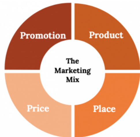
Figure 14.4: The Marketing Mix

Pricing will be covered in more detail in its own dedicated chapter.