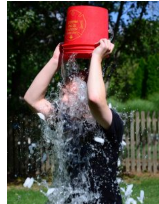
Figure 14.13: The ALS Ice Bucket Challenge in Action

To get an idea of the power of social media marketing, think of the ALS Ice Bucket Challenge. According to the ALS Association: “the ALS Ice Bucket Challenge started in the summer of 2014 and became the world’s largest global social media phenomenon. More than 17 million people uploaded their challenge videos to Facebook; these videos were watched by 440 million people a total of 10 billion times.” 32 The ALS Association raised $115 million in six weeks (their usual annual budget was only $20 million). 33 To see how companies try to harness this power, let’s look at social media campaigns of two leaders in this field: PepsiCo (Mountain Dew) and Starbucks.