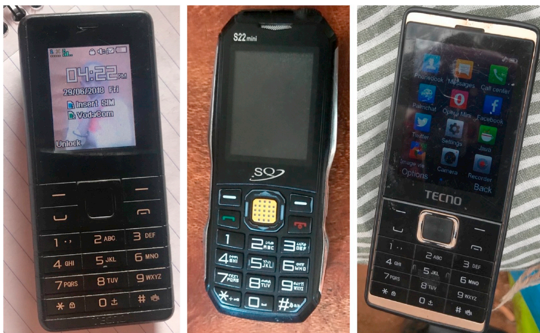
Fig. 3. Left panel; many women use multiple SIM cards; middle panel: women's phones are often dead or charging; right panel: while many phones are internet-enabled, many women often do not know how to use the internet or internet-based applications.

“beep”. This cost-effective strategy is important for people who have very little credit but need to connect with someone.