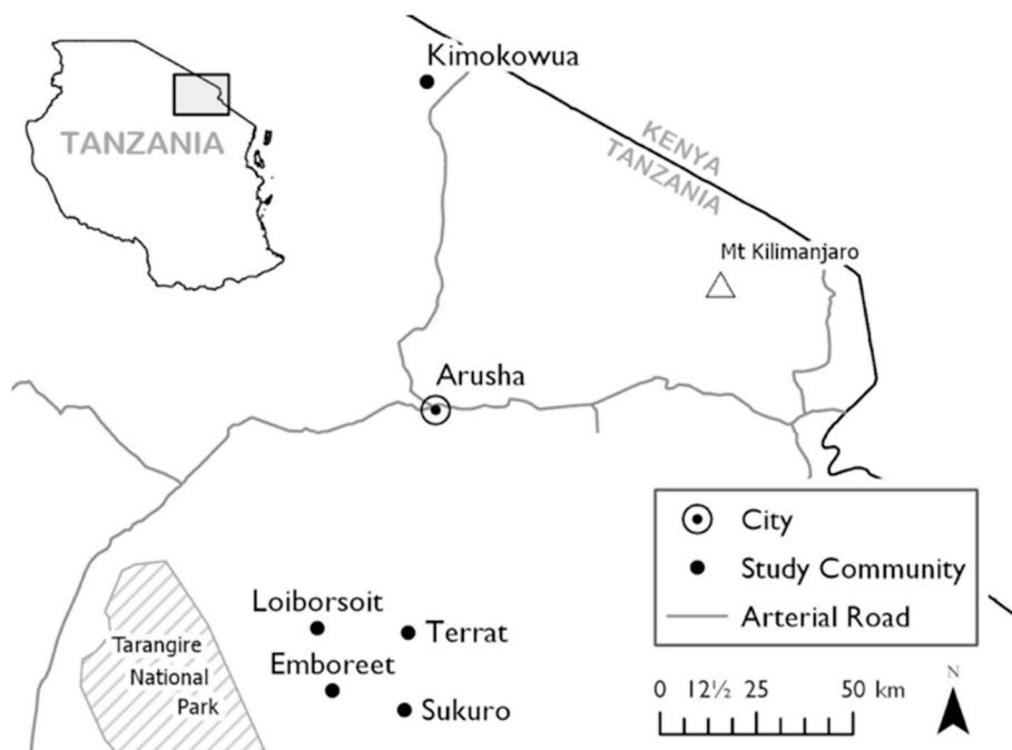
Fig. 2. Map of study area, including village centroids.

Interview participants were recruited by local Maasai research assistants. They exemplified a range of lived experiences, including women of different ages, household wealth statuses, and degrees of