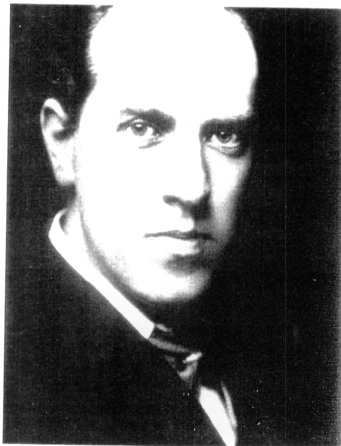
Sir Henry Walford Davies