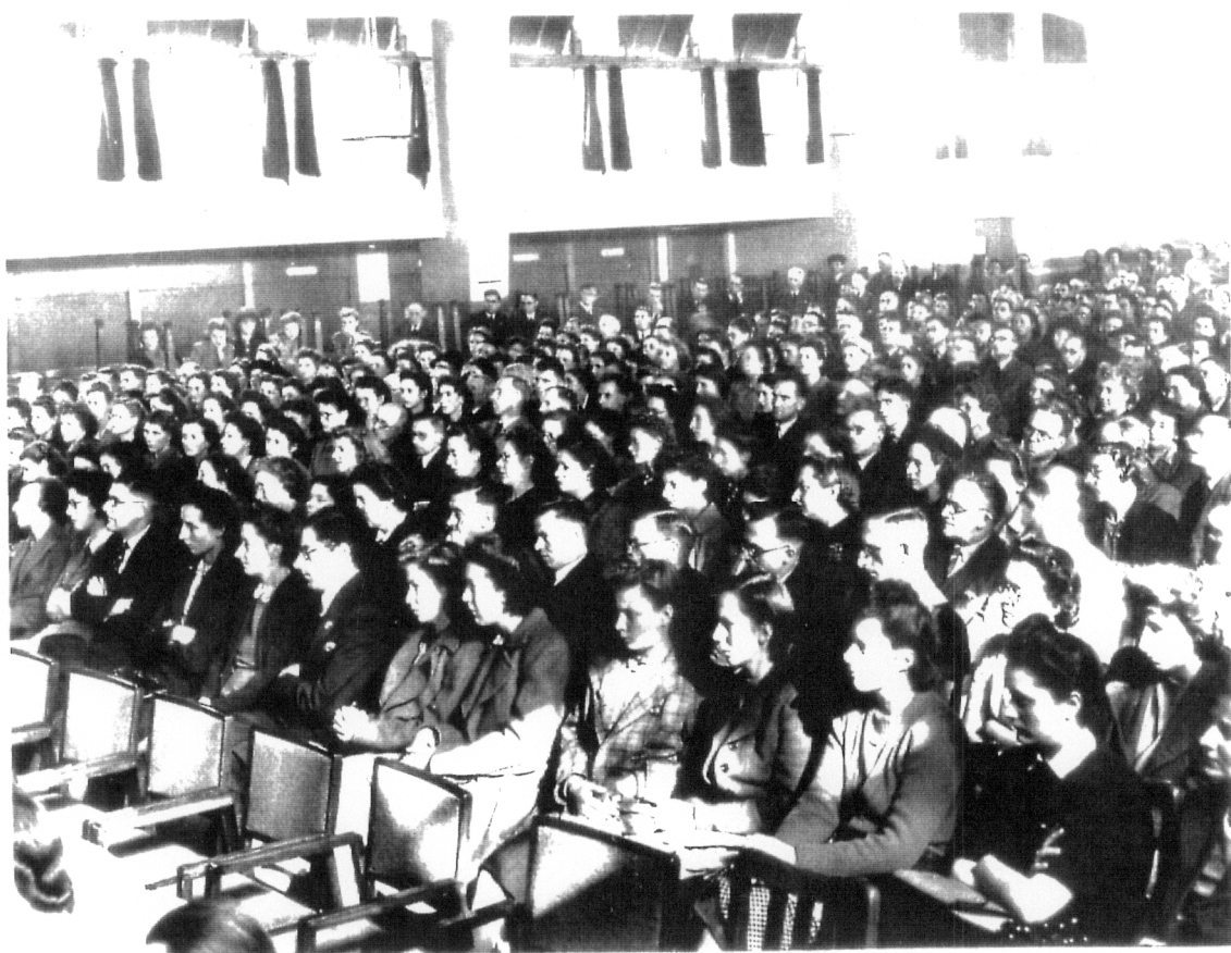
Factory workers listening to a CEMA concert from PRO EL 2/78