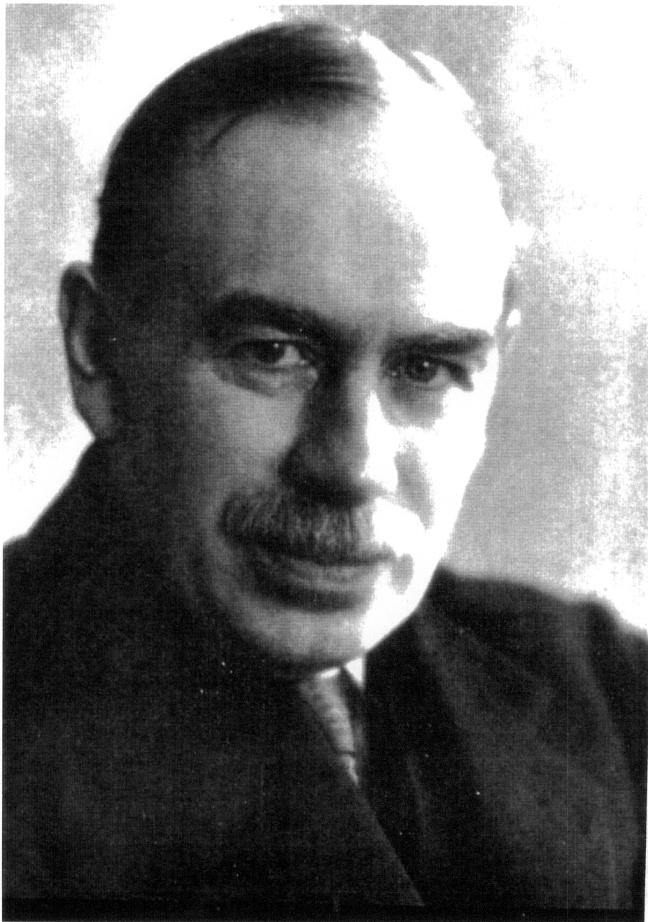
John Maynard Keynes Chairman of CEMA