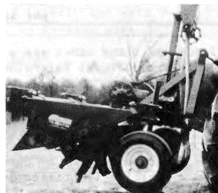
Figure 2. Power driven equipment for soil incorporation of granular pesticides.

For best results it is essential that granules be thoroughly mixed to an 8" depth by a power driven rototiller or other similar equipment suitable for soil incorporation of pesticides (Figure 2). Studies show that application should be made on a 24" wide band for row treatment. Where power driven rototillers are not available - satisfactory nematode control may be obtained by broadcasting the chemical evenly on the soil surface and incorporating it to a 6 inch depth with a double gang disc harrow.