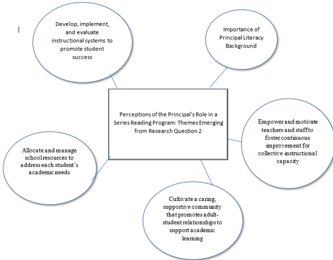
Table 18 and Figure 3 represent the major themes emerging for research question 2.