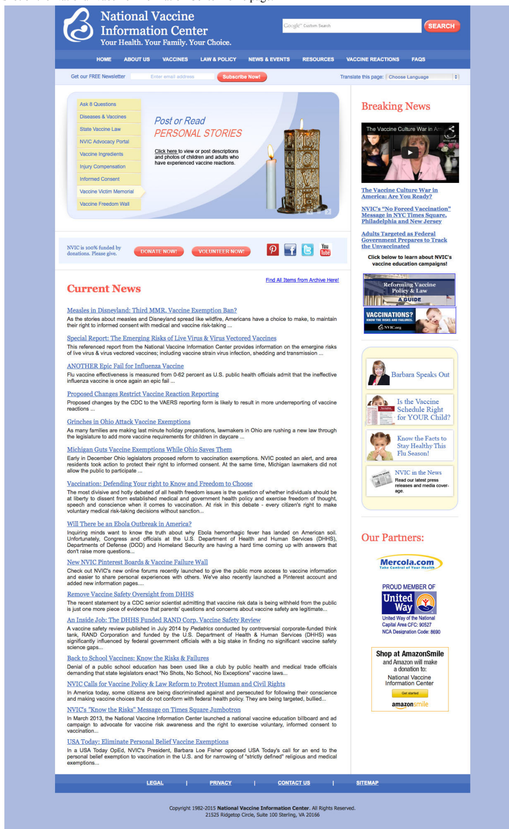
Figure 3. Screenshot of the National Vaccine Information Center home page.

SANE Vax states that its mission is “to promote only safe, affordable, necessary, and effective vaccines and vaccination practices through education and information” [58] (Figure 4).