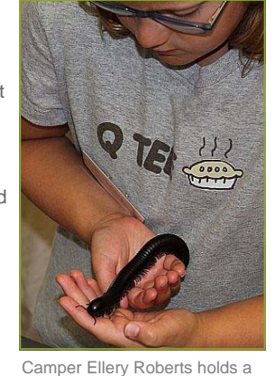
tropical millipede during "Bug Day."

cards, paper garden hats, used milk jugs for our gallon greenhouses, and plastic pepper jars for terrariums. Each child went home with probably too many things (apologies to parents), but we sure did have fun making them! And hopefully they are all composting kitchen scraps by feeding their worms in the vermicompost bin they constructed. Watch for more information on next summer's camp!