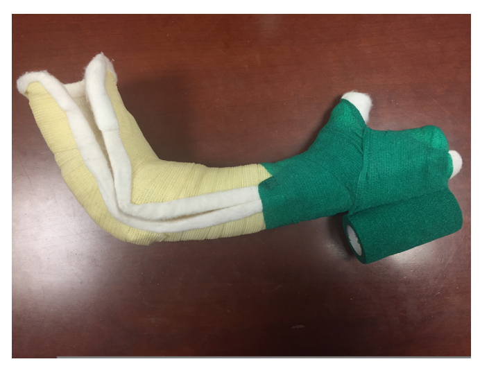
Figure 4 Image of constructed cast with self-adhesive wrap used to secure it on a child's arm.

in other types of therapy, and thus familiar to licensed and certified therapists.