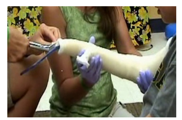
Figure 3 Cast is univalved immediately after construction for easy removal.

For the part-time splinting condition, a resting hand splint with Velcro straps is used. This type of restraint limits hand function without limiting gross motor movements of the arm. In a resting hand splint, the fingers are held with the metacarpophalangeal (MCPs) in approximately 30° flexion and the wrist in neutral. The resting hand splint does not limit elbow movement. The constraint is easily removed and is used only during the therapy sessions. This form of resting splint is widely used