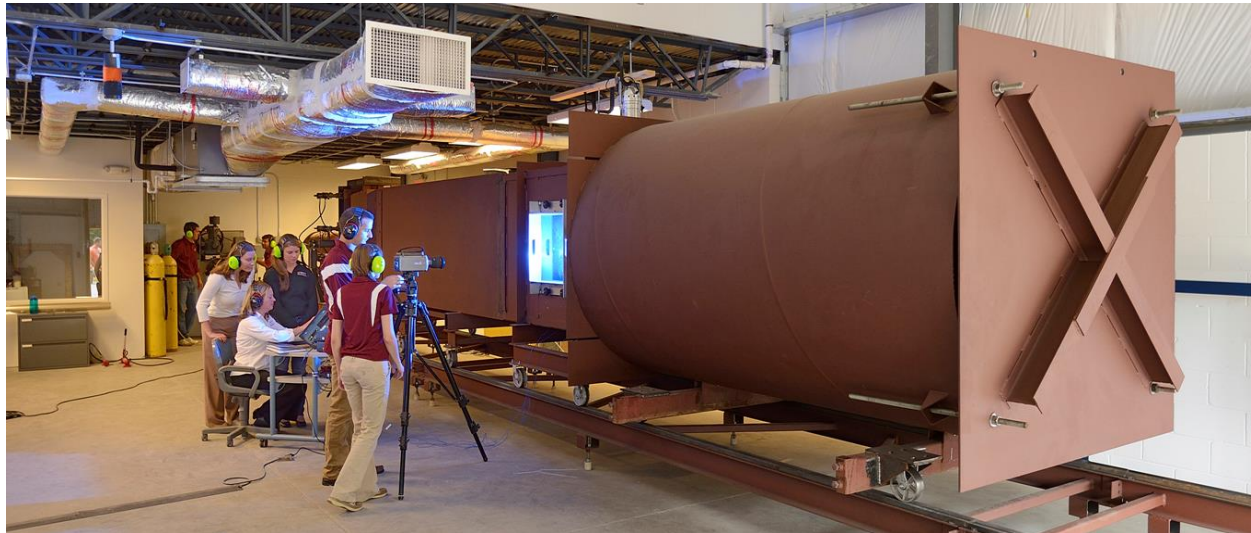
Figure 4: The new Shock Tube Laboratory includes custom shock testing capabilities including this large four foot cross section shock tube.