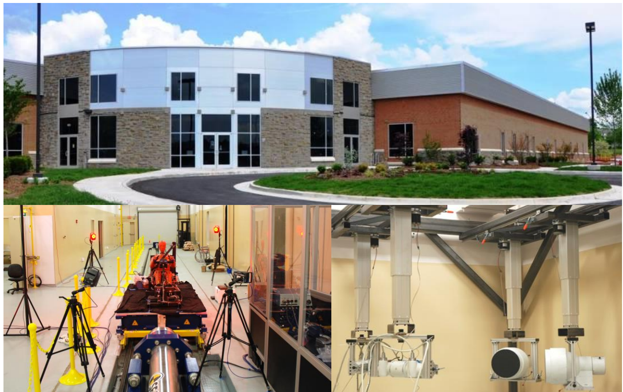
Figure 2: Impact Crash Sled Laboratory on the Virginia Tech campus which houses the sled and high-speed x-ray system in addition to organ and tissue level testing fixtures.