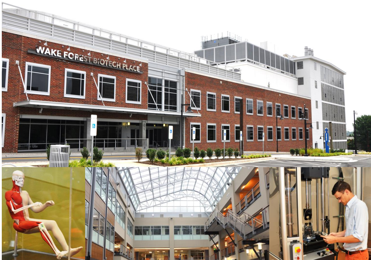
Figure 5: The recently opened Biotech Place at Wake Forest University houses extensive experimental and computational facilities for CIB faculty and students.