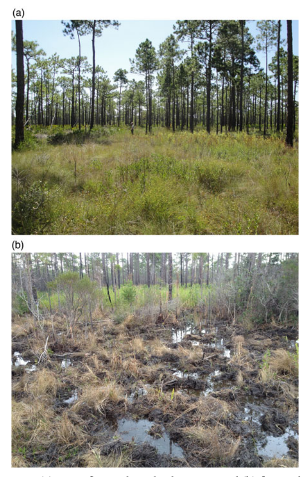
PLATE 1 (a) Intact flatwoods wetland ecotone, and (b) flatwoods wetland ecotone with recent rooting damage to herbaceous vegetation caused by feral swine Sus scrofa , on Eglin Air Force Base, Florida, USA.

86% of sites where hog presence was recorded were damaged (Fig. 1).