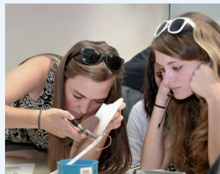
Congress delegates enjoy practicing food safety skills and learning about electricity and circuits during workshops.

During the Drones and Other Unmanned Aerial Vehicles workshop, participants view a demonstration of drone technology.