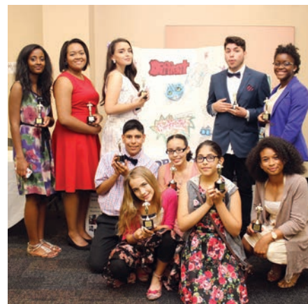
The Keystone and Torch 4-H Club production team celebrates after receiving a 4-H Oscar for its digital media project, "I'm Different and It's OK," at the 2015 Virginia Youth Voices Red Carpet Event.

more likely to be physically active and are nearly two times more likely to plan to go to college than their peers.