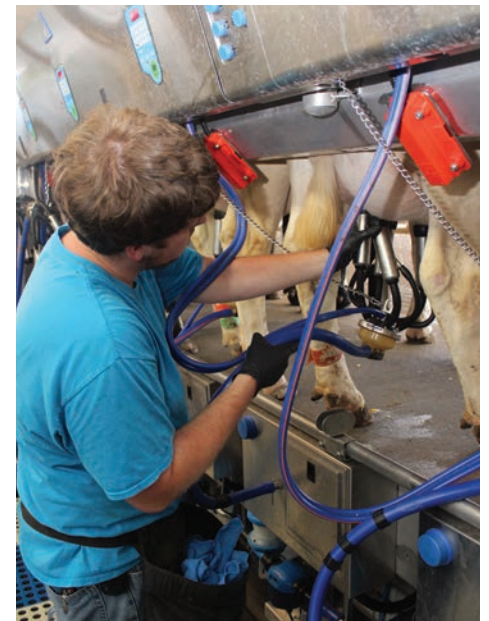
A Virginia Tech student milks cows at the new Dairy Science Complex – Kentland Farm.