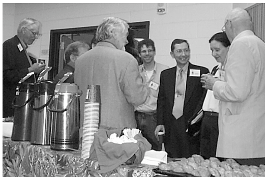
Conference speakers taking a coffee break