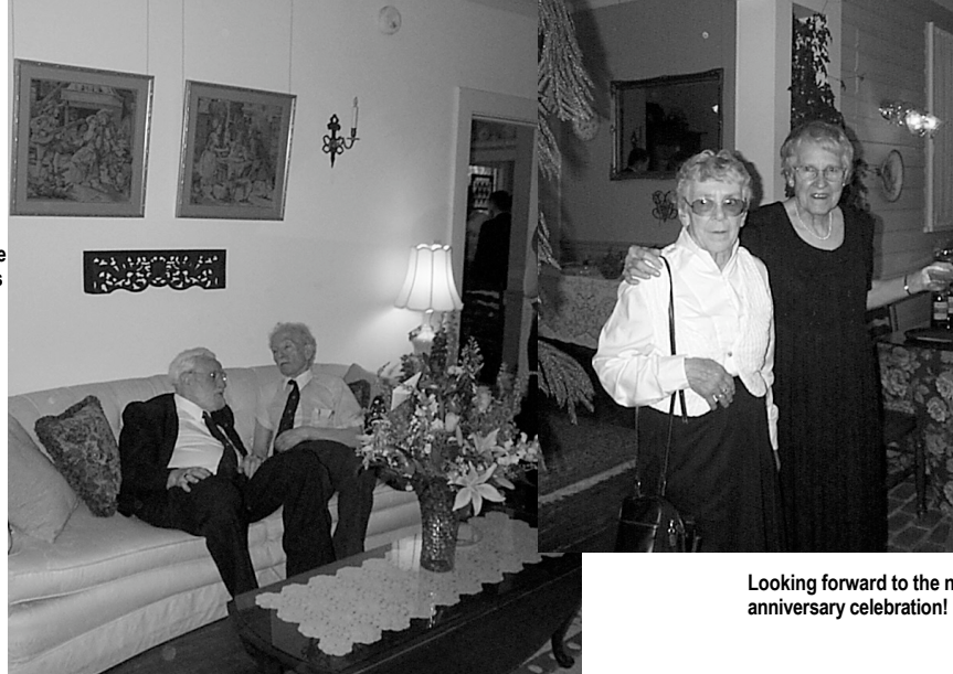
Looking forward to the next anniversary celebration!