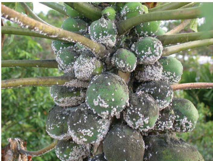
Figure 2. Papaya mealybug.

During these two phases, the IPM CRSP in collaboration with its national partners concentrated on identifying the major pest and disease problems of high value vegetable crops, developing management tactics, and transferring technologies to farmers to replace the use of chemical pesticides. To cite a couple of examples, to overcome the soil-borne bacterial wilt ( Ralstonia solanacearum ) of solanaceous crops, grafting on resistant rootstock, like wild eggplant, was adopted in Bangladesh. To manage the devastating tomato yellow leaf curl virus (TYLCV), the technology of a host-free period was introduced in Mali (Norton et al. , 2005; Heinrichs et al. , 2006).