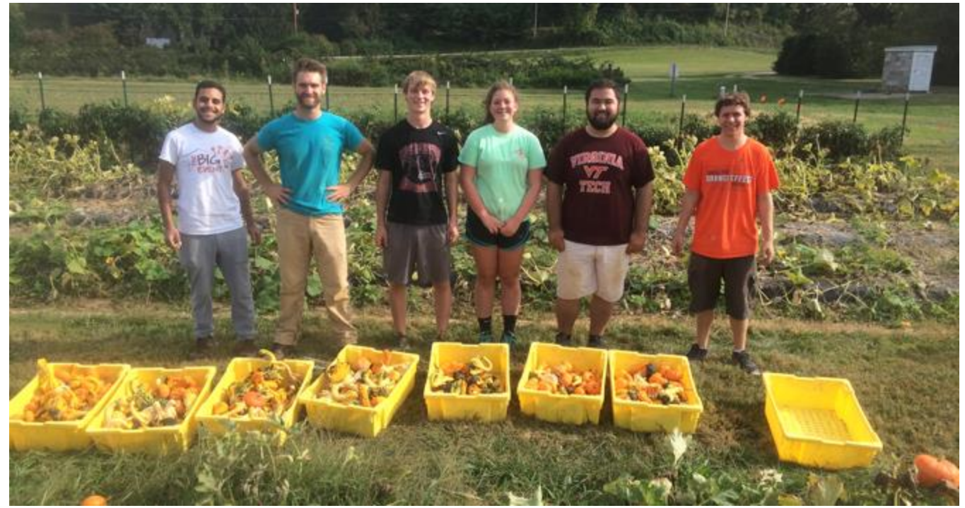
Student volunteers from Engineers Without Borders with a harvest of decorative gourds.

Virginia Tech Summer Academy: Animal and Poultry Sciences Track. Governors School for Agriculture at Virginia Tech