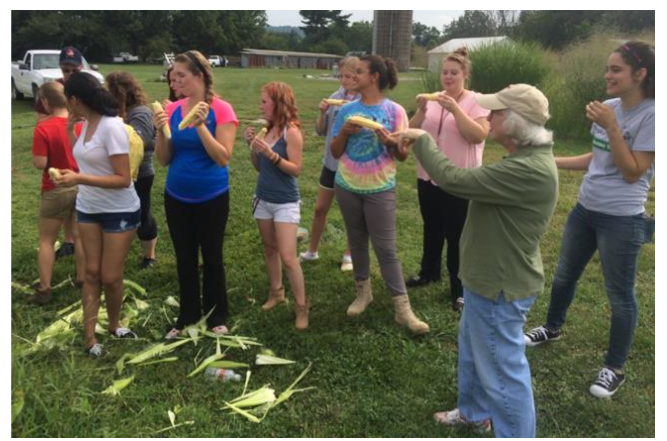
Virginia Tech Summer Academy: Animal and Poultry Sciences Track taste-testing sweet corn.