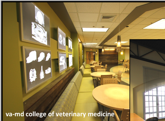
va-md college of veterinary medicine

In 2008, she earned a Certified Professional Secretary and Certified Administrative Professional (CPS/CAP) certification, and was re-certified as a Certified Administrative Professional-Office Manager (CAP-OM) through the International Association of Administrative Professionals in 2013.