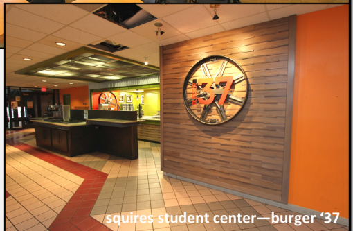
squires student center—burger '37