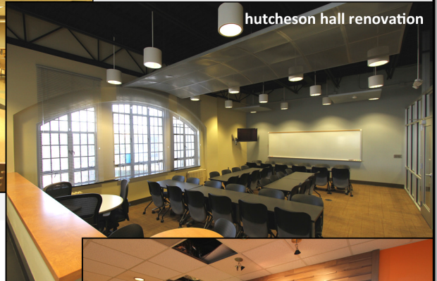
hutcheson hall renovation

Colley Architects is a proud supporter of the James D. McComas Staff Leadership Seminar