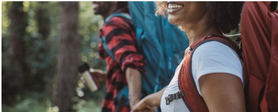
Ask your travel advisor for insider tips to keep in mind during your trip.

destination page for current requirements, a resort website for specific guidelines, but working with a travel advisor provides a one-stop-shop for all things travel related. The key is making the most out of the experience.