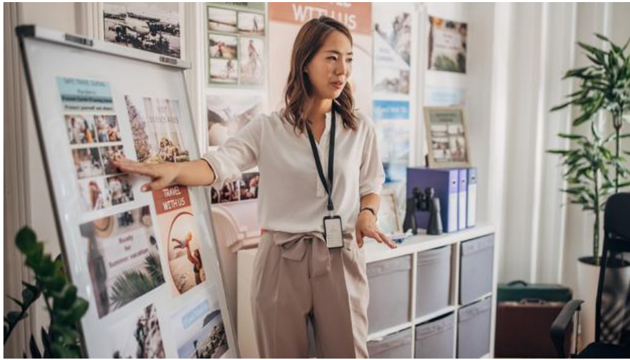
Travel advisor sharing information.

Right off the bat, it's important for clients to talk to their advisors about the logistics of travel. Those who are set on specific budgets need to be upfront and ask if it's doable to stay within their price range. It's also important to ask what's all included if it's not transparent at first glance.