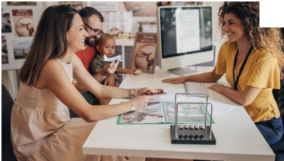
A family working with a travel advisor.

People are sometimes hesitant to work with travel advisors for a variety of reasons. Some think it's more expensive to book travel through an agency, and others are set on planning everything on their own. Once travelers learn it's the same price (and in some cases less expensive) to work with an agent, they're more apt to give it a try.